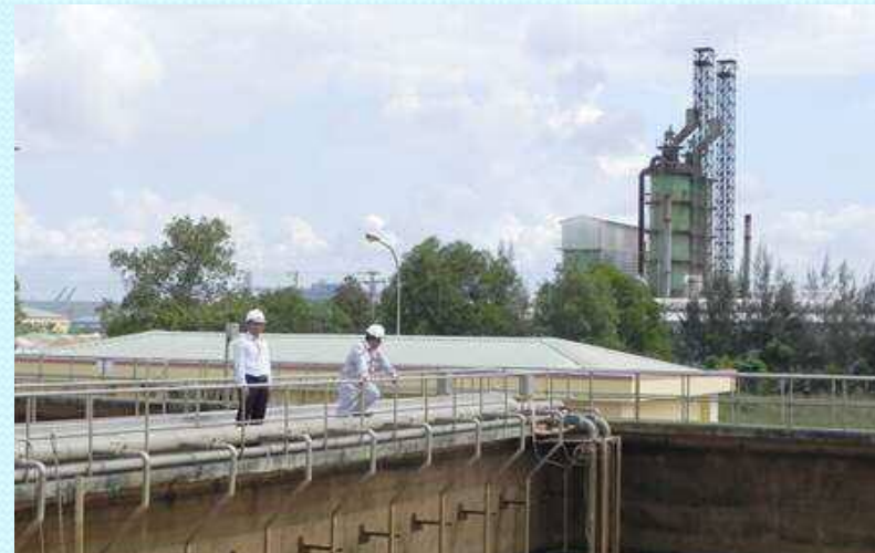
Đông Xuyên Industrial Zone