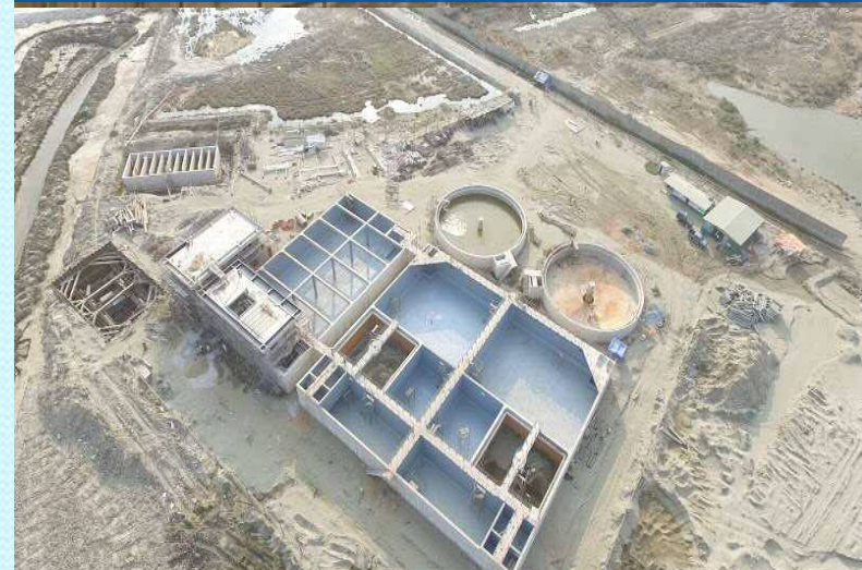
Phú Mỹ III Industrial Zone