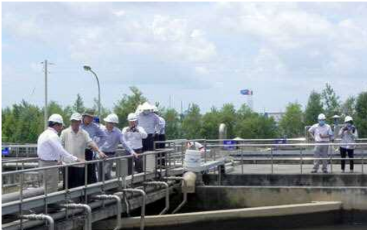
Phú Mỹ I Industrial Zone