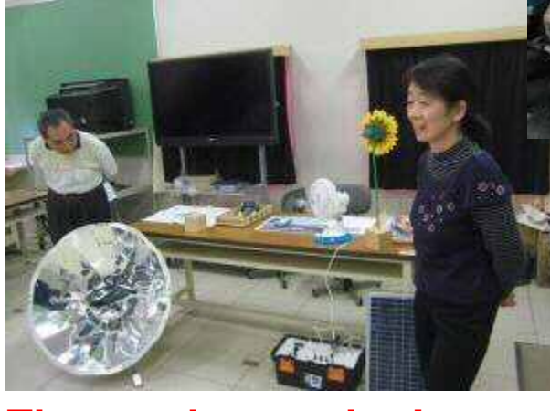
The sun is amazing! (solar team)

Initiatives on global warming in the city (environmental education, study PRJ, Kawasaki Center)