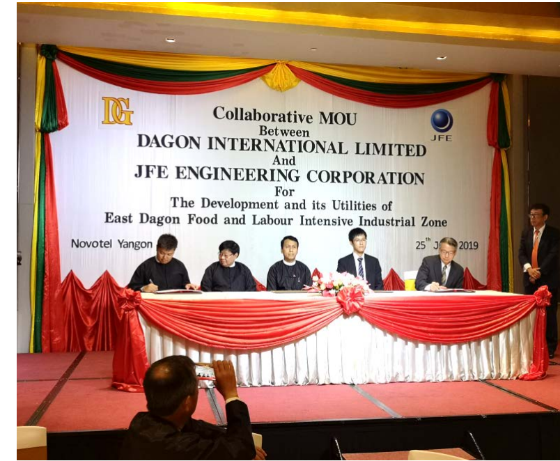
MOU Signing Ceremony (June 2019) Dagon International Limited and JFE Engineering Corporation