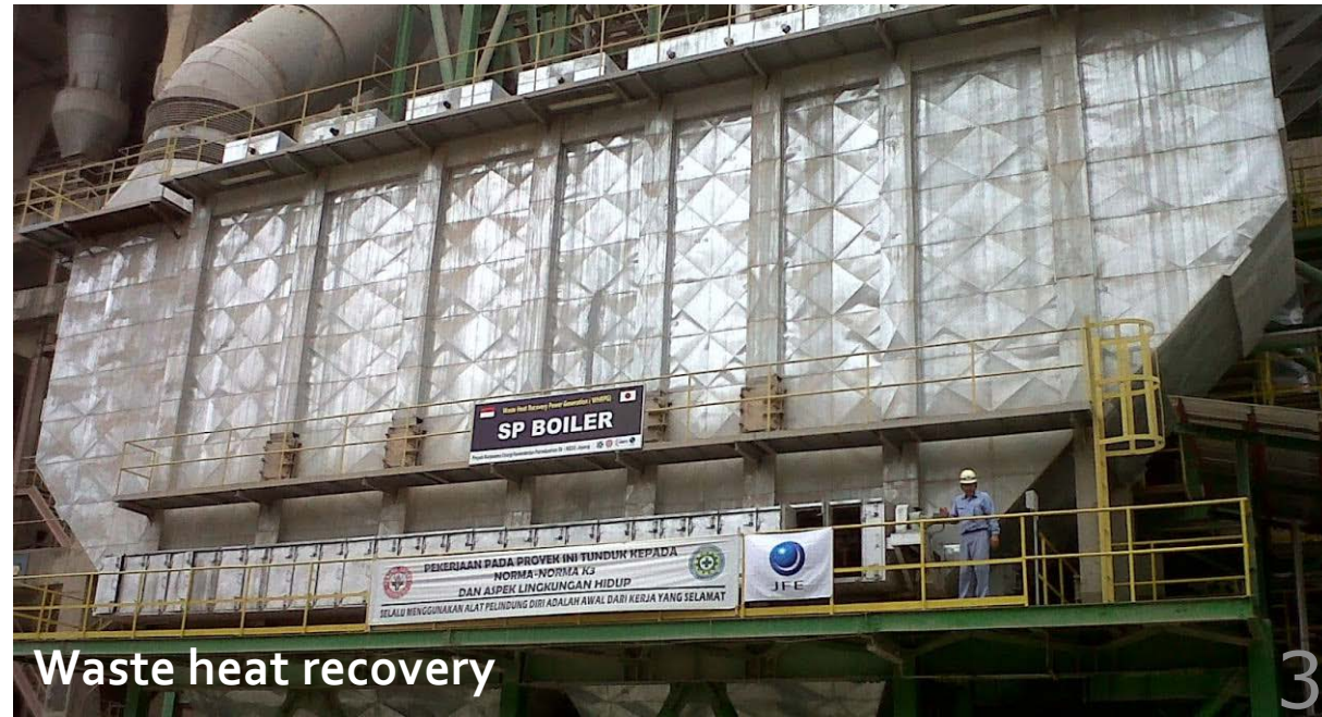
Waste heat recovery