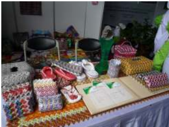
Exhibition of goods made from waste