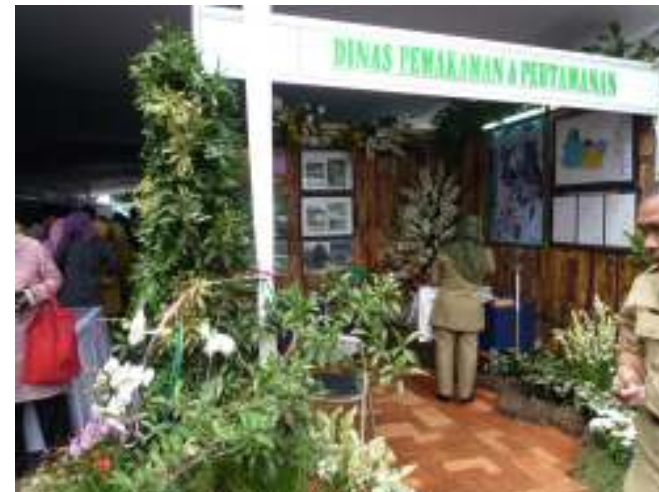
Exhibition of greenery