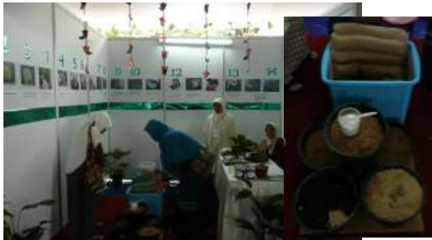
Exhibition for promoting composts