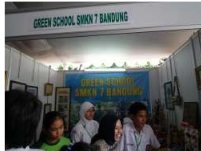
Exhibition of initiatives by a school